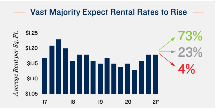
Arrow and Percent Represent Expectations for the Next I2 Months